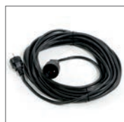
Practical 15 m power cord.

Equipped with a pump, two adjustable nozzles with a 2-position switch for solution spraying.