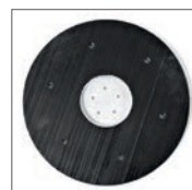
Full Velcro pad driver.