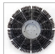
PBT washing brush.