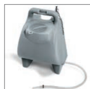
15 liter polyethylene tank.